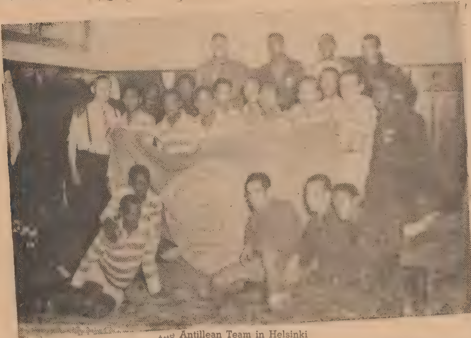
The Antillean Team in Helsinki The Antillean representatives at the Olympic games arrived in Helsinki this week.

On Monday July 21, our boys will face Turkey on the ball field. It will be the Antilles' big day of sports. Let's all keep our fingers crossed.